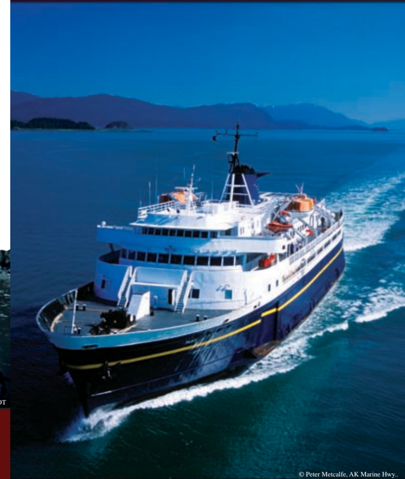
AK Marine Hwy.